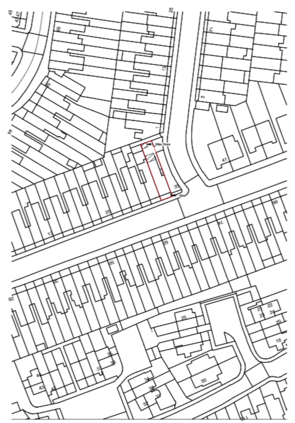
Figure 1 - Site Location Plan