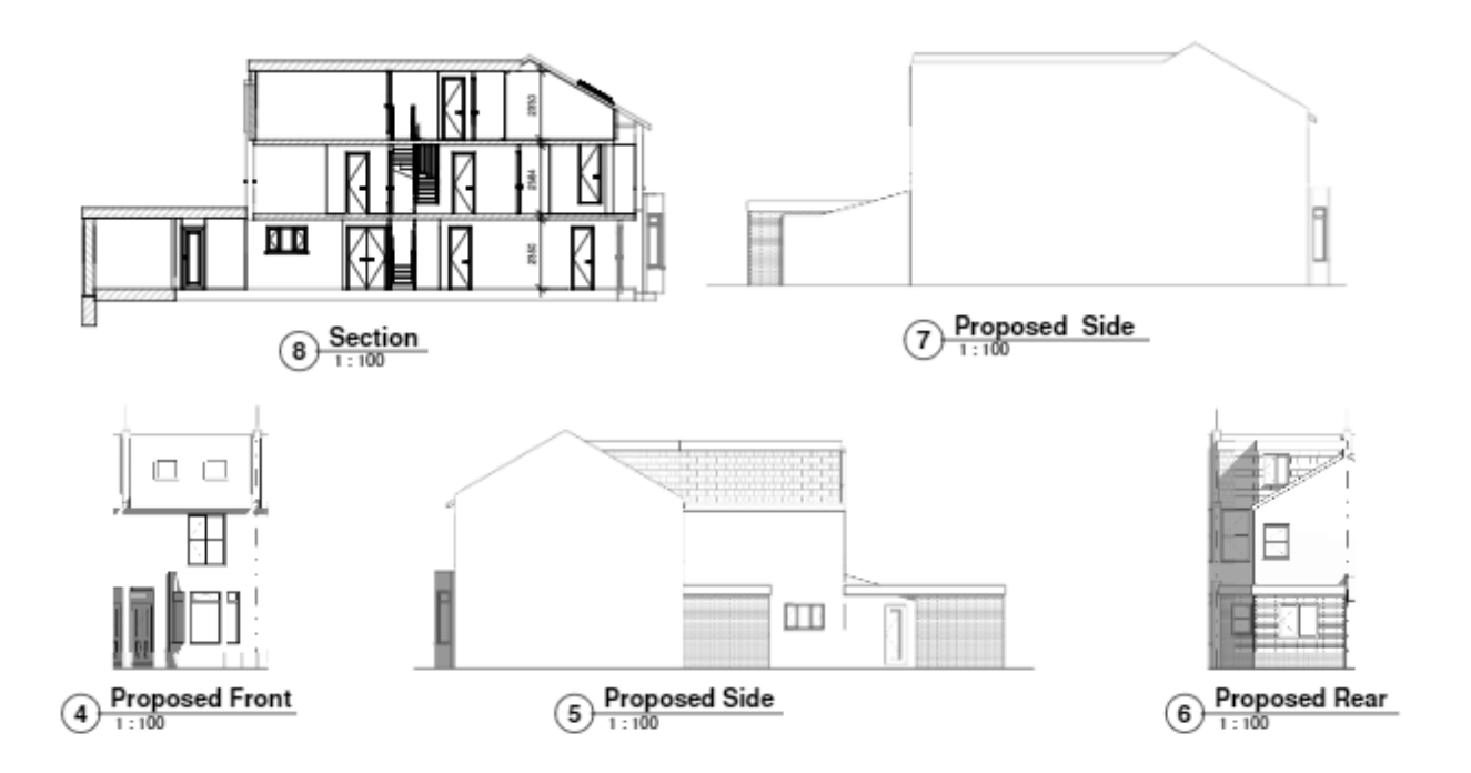
Figure 3 - Proposed Elevations